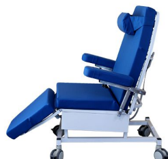
Chair Position .