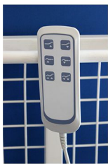
Corded Remote Control .