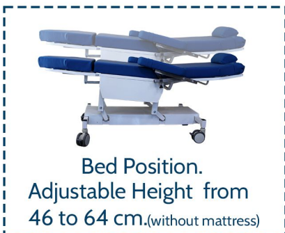
Bed Position. Adjustable Height from 46 to 64 cm.(without mattress)