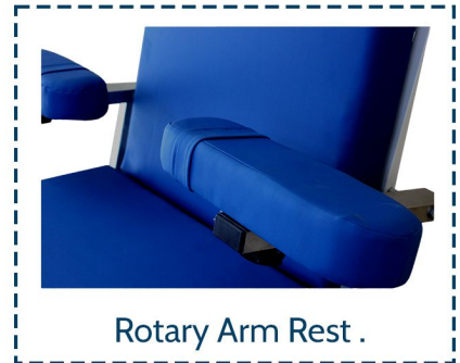
Rotary Arm Rest .