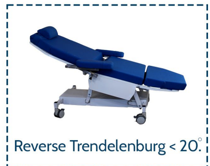
Reverse Trendelenburg <math>< 20^\circ</math>