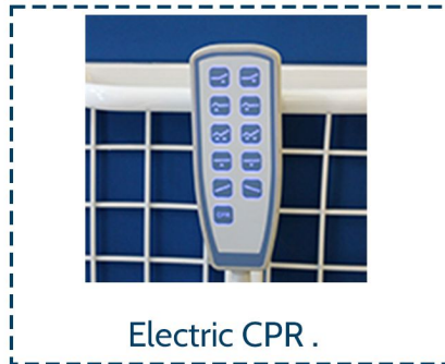
Electric CPR .