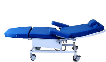
Bed Position .