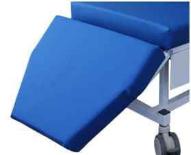
Foot Rest (optional) .