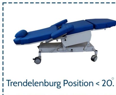
Trendelenburg Position <math>< 20^\circ</math>