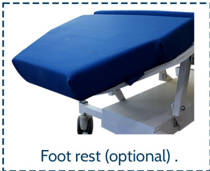
Foot rest (optional) .