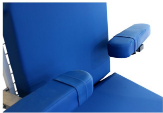
Rotary Arm Rest .