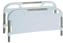
LS900W ABS, Removable . Supported with Epoxy coated steel pipe .