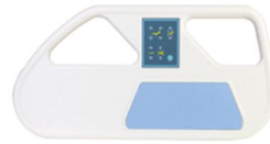
HJCP35H03 (4 pcs) ABS, 2 pcs, each side, with integrated patient control panel .