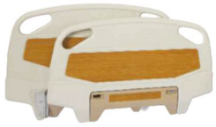
LS900B ABS, Removable .