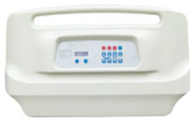
JCP35-ZT ABS, Removable . with integrated Nurse control for Electric Beds only .