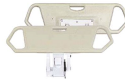
LS-750L (2pcs) ABS, 1 pcs, each side .