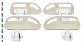
LS-750M (4pcs) ABS, 2 pcs, each side .