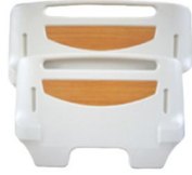
JCP35-Z2 ABS, Removable .